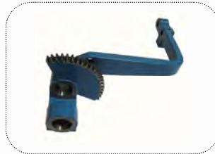
Philips Blue Painting