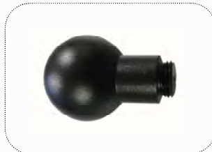
Shot Blast + Black Anodized