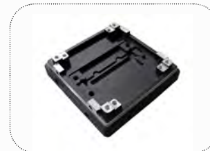
Sand Blast + Black Anodized