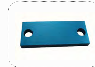
Brush + Blue Anodized