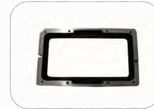
Partial RoHS Painting